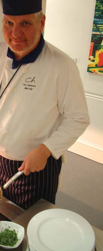
An impressive choice is offered to staff in the main restaurant at lunchtimes, managed by contract caterer Charlton House. Pictured is the display cooking area next to the main food servery and chilled and ambient serveries.

Limited) managed the project in two phases, starting with the western end, which opened in September 2002 providing accommodation, for the Treasury, overlooking St James's Park.