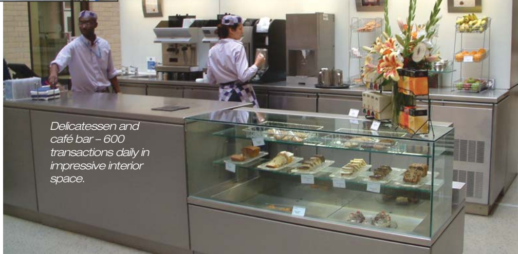
Delicatessen and café bar – 600 transactions daily in impressive interior space.