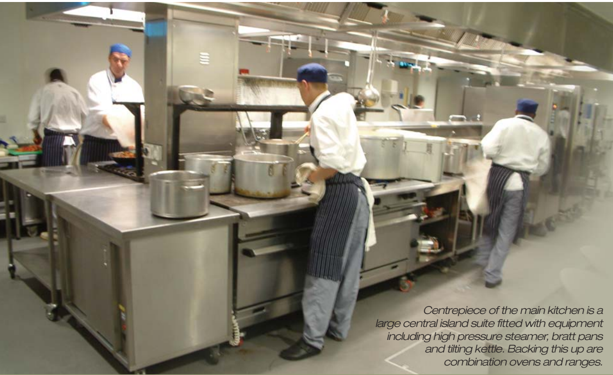
Centrepiece of the main kitchen is a large central island suite fitted with equipment including high pressure steamer, bratt pans and tilting kettle. Backing this up are combination ovens and ranges.